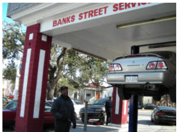
Banks Street Service Station – 5’ of Water Reopened last October