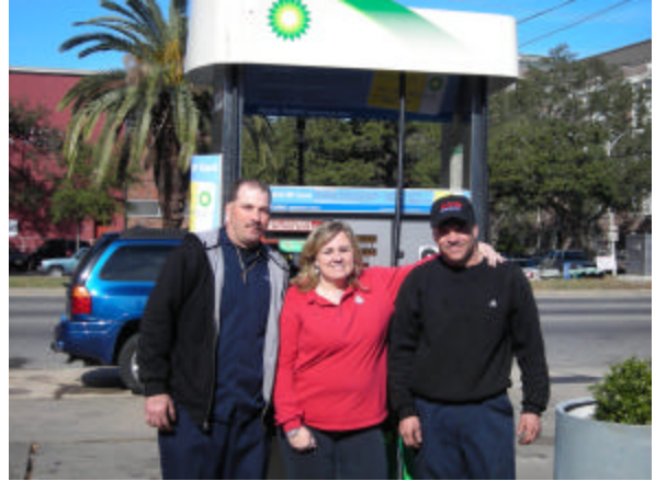
Amoco Station 5’ of Water - Open Now