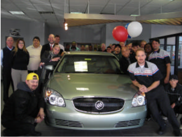
Mossy Motors – 7’ of Water Open In January