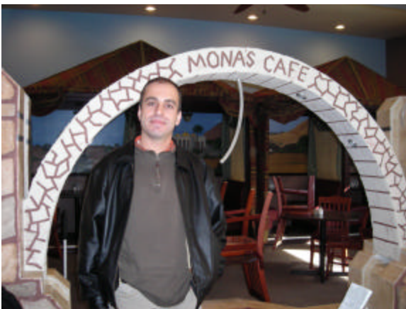
Mona's Café – 4’ of Water Reopened last April