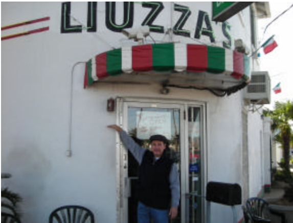
Liuzza's – 6 ½ ‘ of Water Beer – May '06, Food – July '06