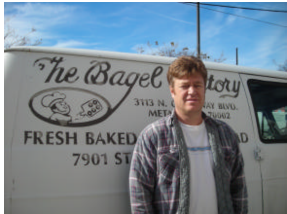
The Bagel Factory – 4’ of Water Reopened last November